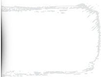
BRILLIANT WHITE 750ML