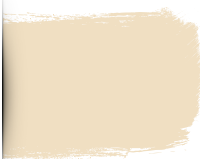
PALE CREAM 750ML