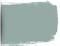
AQUA LEAF 750ML