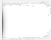
BRILLIANT WHITE 750ML

For optimum 6 year life use Exterior Quick Dry Primer Undercoat and Satin as a system